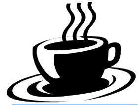
Mother's Day Tea Party in first grade

with several songs in the afternoon. They all enjoyed refreshments afterwards.