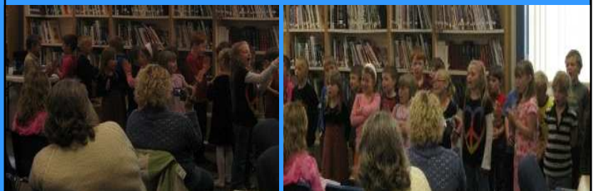
1st Grade perform for their mothers at the "Tea Party"